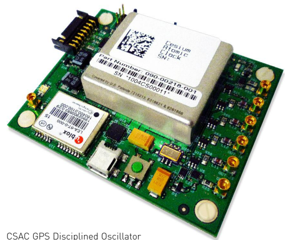
CSAC GPS Disciplined Oscillator

Optional features include an extended operating temperature range (-40 °C to +85 °C), a 10MHz CMOS output, and the ability to delete the phase noise filter.